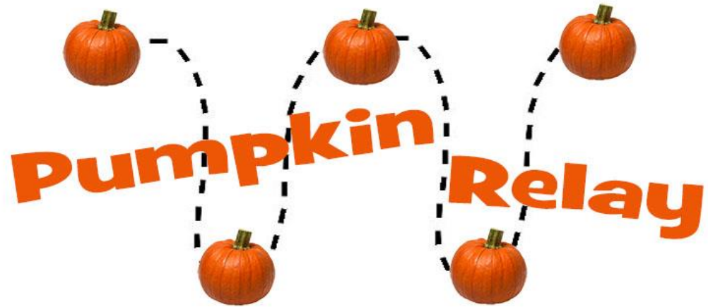
The Up, Down Pumpkin Game