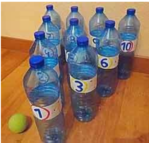
Bowling for bottles