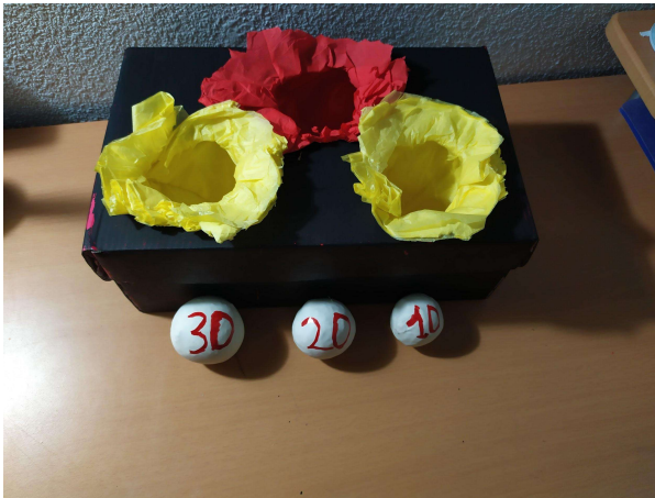
“Make the shot”