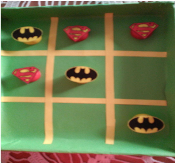
Tic-Tac-Toe--three in a row