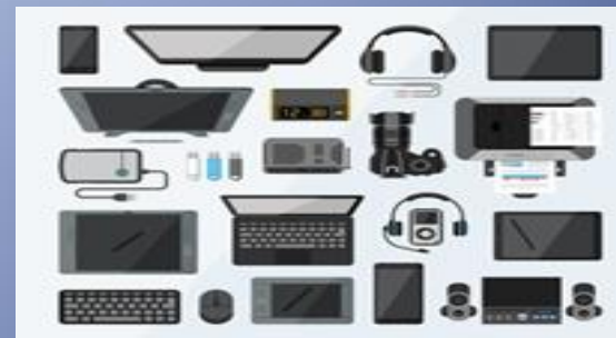
Information Technology skills