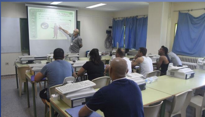
An inter-block group