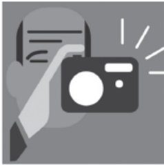
take photo a take a photo