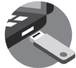
7 stick in a plug memory