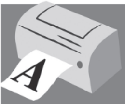
4 document a print