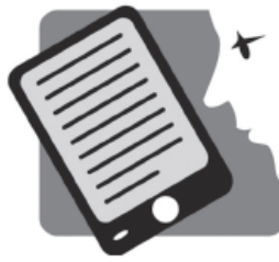
2 e-book an read