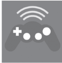
1 a game play video