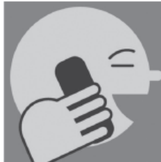
6 call a phone make