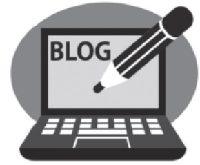
3 a comment post