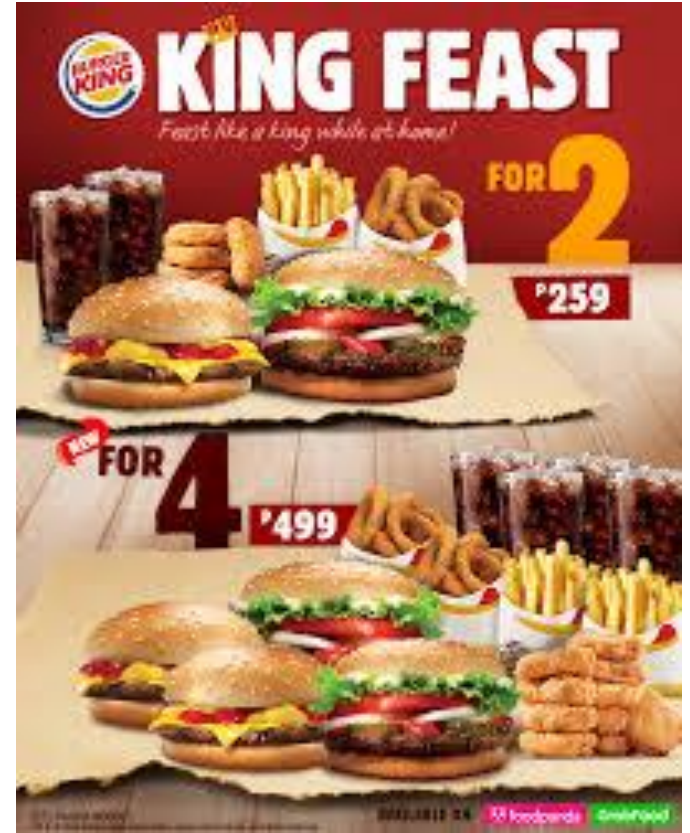
Your favorite fast food meal