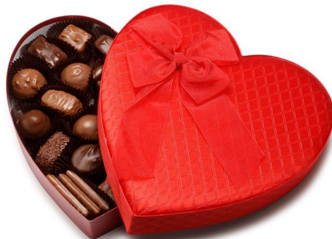
A Box of Chocolates