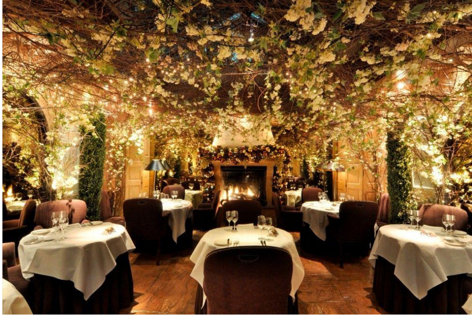
Dinner at a fancy restaurant