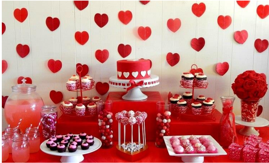
Valentine's Day Party