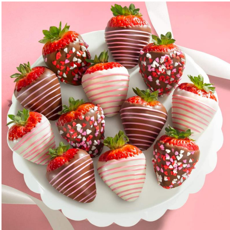
Chocolate Covered Strawberries