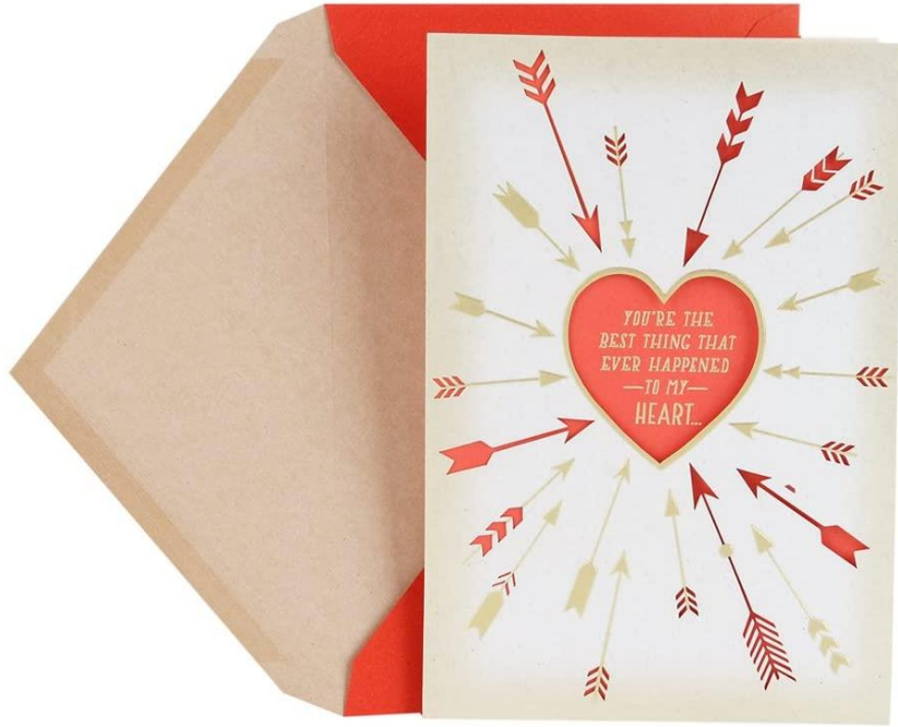
Valentine's Day Card or Letter