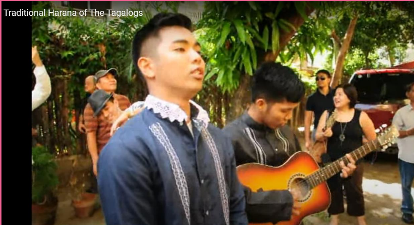
Traditional Harana of The Tagalogs

https://www.youtube.com/watch?v=8mhOUYJeBEk